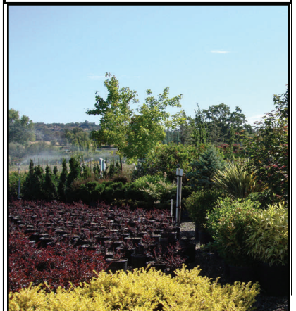
OUR GROWING GROUNDS BERBERIS & COLEONEMA 'SUNSET GOLD'

Protect your roses from aphids and powdery mildew. Treat them early, before they become real problems.